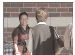
Leadership development at the Church of the Highlands begins with a belief that every believer is a church planter.