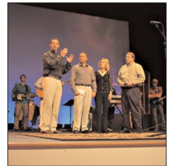
At West Ridge training is spread out over several weeks or several months to increase assimilation and integration of learning.

Each month the planters in training receive assignments to complete. At the monthly meeting they report on how they are applying previous learning. This is sometimes done in written form but usually it is done orally within the group. They then share something new that they learned from that month’s experience. Finally, they share something that they have come to realize they need in their personal development. During these months the planters in training are exposed to key staff and former church planters from West Ridge. They all share personal stories and give examples of some of their best practices. Jim says “I want our planters in training to see both theory and practice.” He is beginning to work more closely with some Bible colleges and seminaries. “Our dream is to become an education site for church planters.” Jim expects his trainees to begin the planting process before the nine months are completed. Last year West